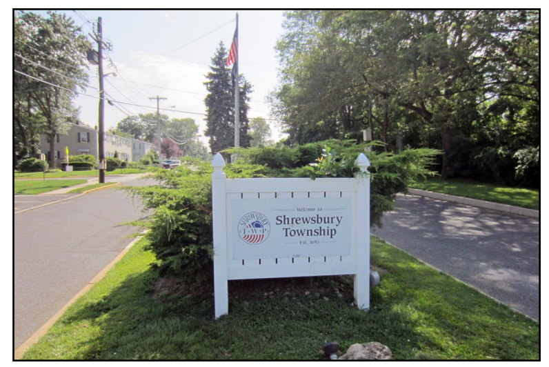
Entrance to Shrewsbury Township

Shrewsbury Township was one of the original three townships located within Monmouth County, dating back to 1693. At the time of inception, the Township covered almost 1,000 square miles, ranging from the Navensink River to all of present-day Ocean County. After several municipalities seceded from the Township to create their own municipalitiy (e.g. Red Bank, Eatontown, and Shrewsbury Borough), the U.S. Army, in cooperation with the Federal Public Housing Authority, bought the remaining land in Shrewsbury Township and constructed 265 homes during World War II (accommodating the influx of personnel assigned to Fort Monmouth). The Township now encompasses 0.1 square miles and is the smallest municipality, in terms of land area, in the County. Source: www.army.mil/info/organization/cecom/